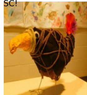
One of the students' bird projects on display in the FEMA building for Fine Arts Week.