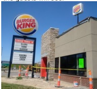
Everyone's favorite local fast food restaurant, Burger King.

pride in the detail of their work. Many may be able to do their remodels with a cheaper budget, but in the end Burger King wants to provide guests with the best quality product possible that will last. The remodel is projected to be completed mid-May. Burger King is confident their guests will like the new changes and latest image for the Burger King brand. It should be an exciting new look for the community. Both the exterior and dining room package were getting past their useful life. The exterior look will be the most impactful change the guests will see.