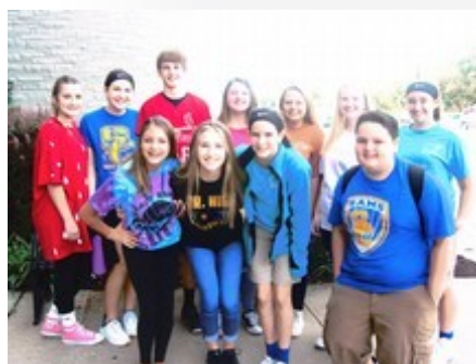
Middle school publications staff at the SEMO University Center for the annual Josten's yearbook workshop.