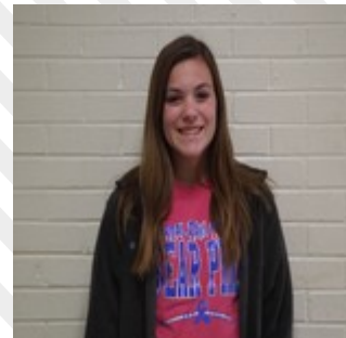
Summer 8 th gr. player